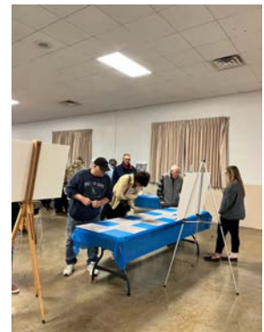
Catawba Islander Trail and Greenway Master Plan Open House