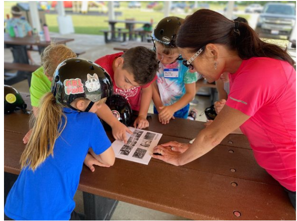
Bike Safety Day at Hopfinger Zimmerman Memorial Park