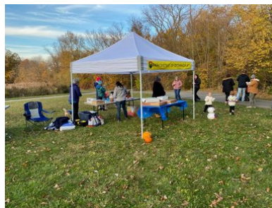
Jack-o-Lantern Walk at Meadowbrook Marsh