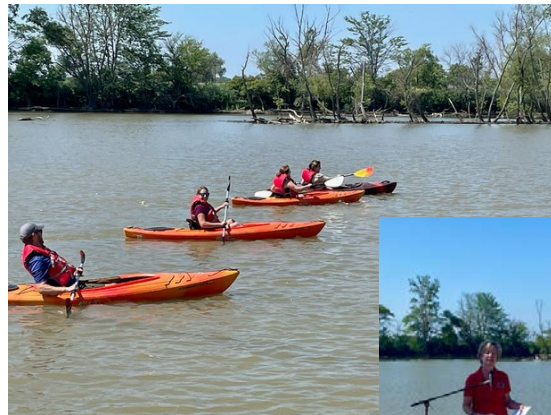
Portage River Watertrail Ribbon Cutting