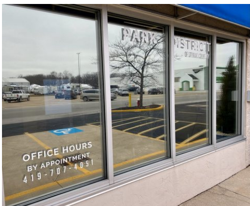
Park District Office