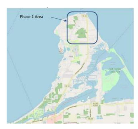
Phase One Master Plan Catawba Islander Trail and Greenway