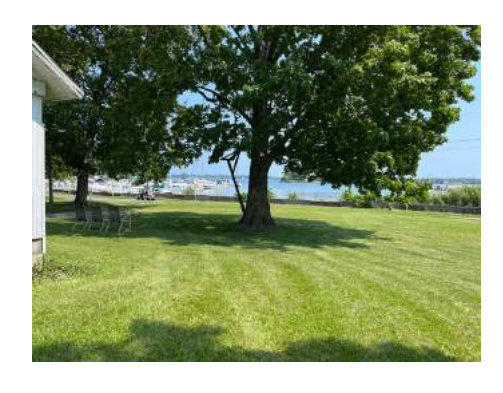
Put-in-Bay Township Park District Duff Homestead Acquisition