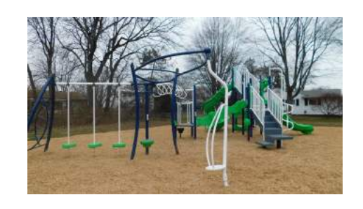
Port Clinton Portage Park Playground

The Park District sponsored 16 grants throughout the county through the Parks and Trails Improvement Grant Program.