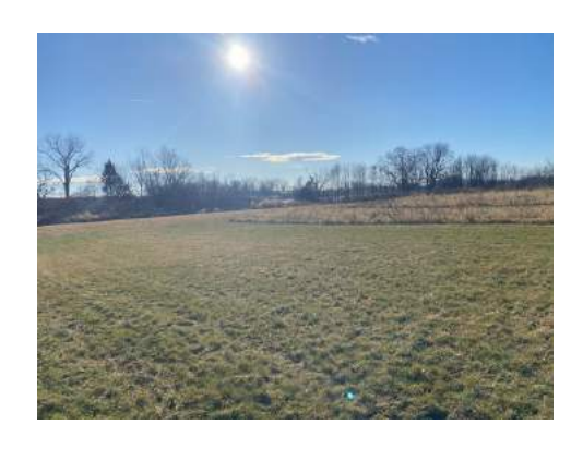
West Harbor Property donated by the Black Swamp Conservancy in December 2023.