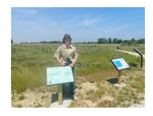
Oak Harbor Library Storywalk at Ottawa National Wildlife Refuge Fox Unit