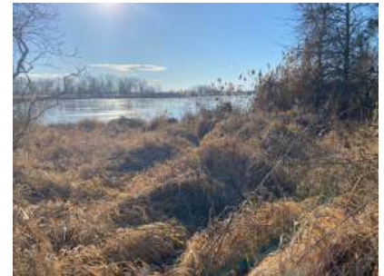
West Harbor Preserve Catawba Island Township