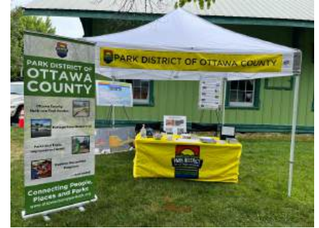
The Park District has a vendor booth at numerous community events throughout the year.