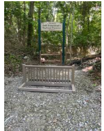
Put-in-Bay Township Park District Duff Homestead Improvements