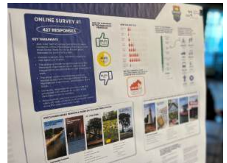
Public survey results, Marblehead Peninsula Trail Feasibility Study