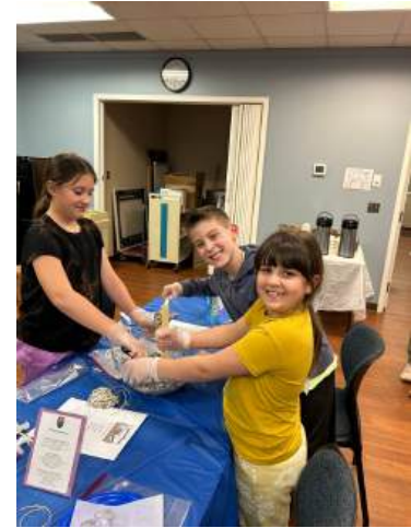
A Tweet Treat Program, Ida Rupp Public Library