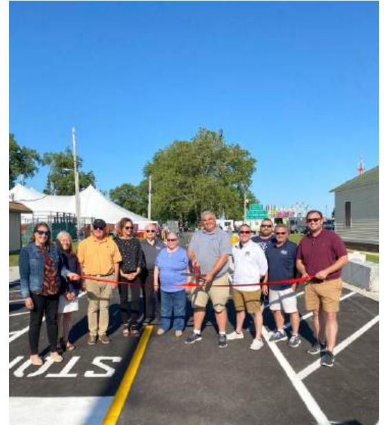
The North Coast Inland Trail extension through Veterans Memorial Park is a win for northwest Ohio bicycling enthusiasts and users of the Trail.