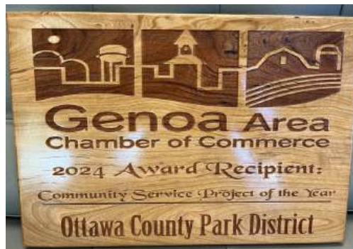
In November 2024, the Genoa Chamber of Commerce recognized the Park District with the Community Service Project of the Year Award.