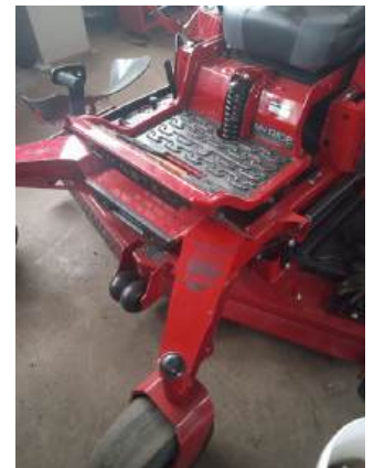
Village of Clay Center Mower