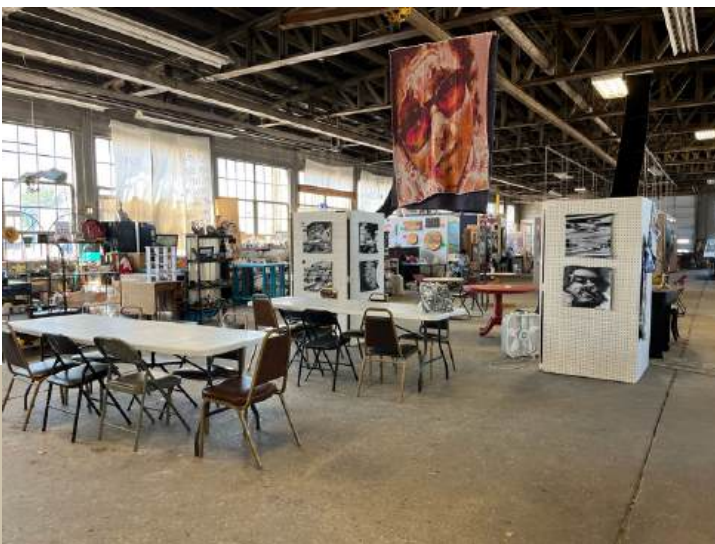
The Park District has hosted several open house events at The Arts Garage in Port Clinton, home to talented working artists.