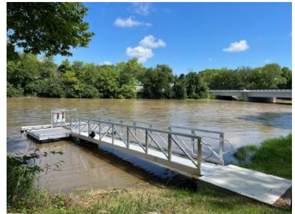
Harry Witty Memorial Park, Portage River Water Trail, Village of Elmore