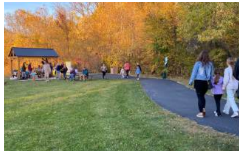
Sunset Pumpkin Walk, Meadowbrook Marsh