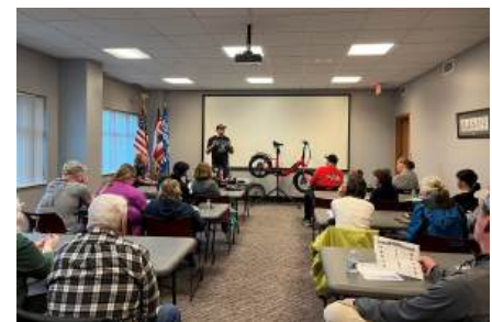
Bike Fix-It Workshop at Shores & Islands Ohio Welcome Center West