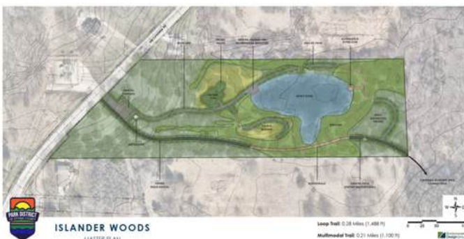
Development of Islander Woods is underway. The site will open to the public by Fall 2025.

The Catawba Park Areas Master Plan developed a conceptual plan for the trailhead area and first segment of Phase One through the Islander Woods and Trailhead.