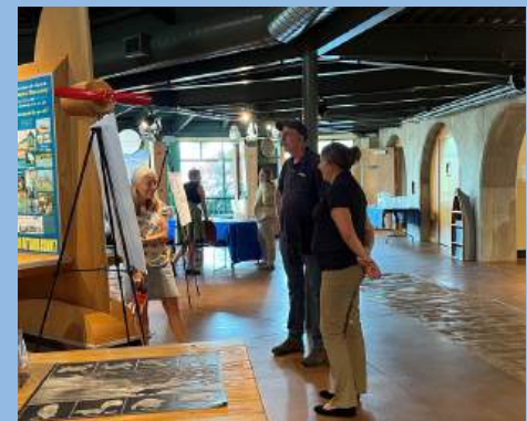
Public Open House Event for the Marblehead Peninsula Trail Feasibility Study