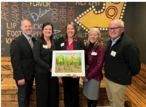
The Park District of Ottawa County was the recipient of the 2024 Economic Development Partner Award from the Ottawa County Improvement Corporation.

2024 OCIC Economic Development Partner of the Year 2024 Genoa Chamber of Commerce Community Service Project of Year Award.