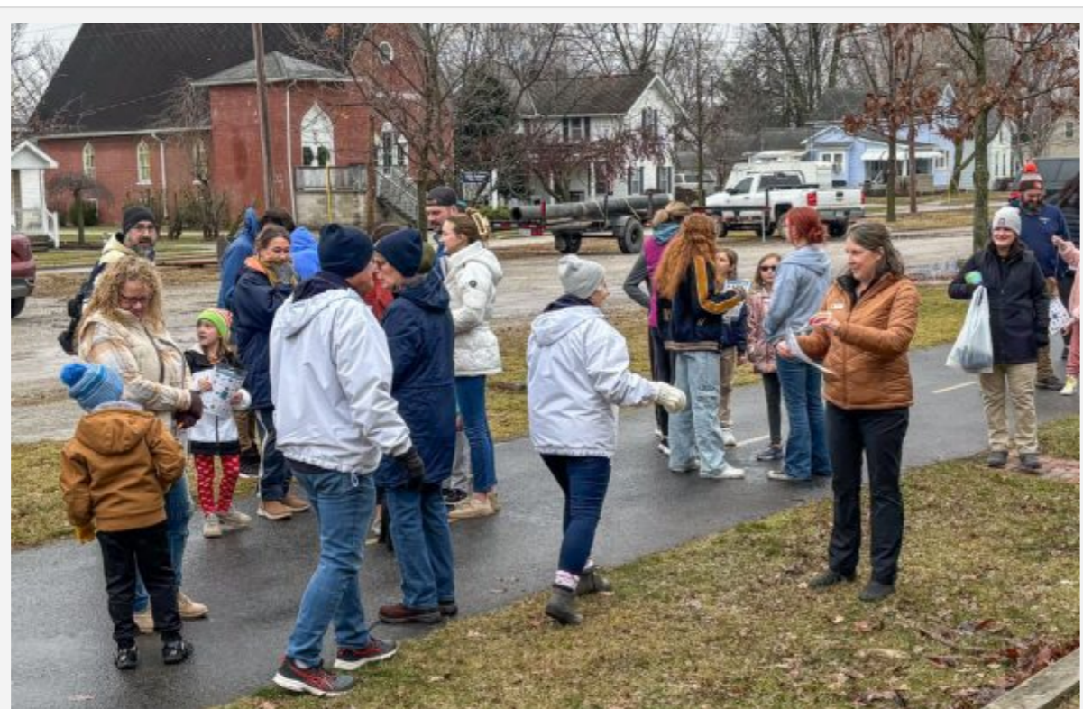
Locals gather in front of the Elmore Historical Barn before hiking down the trail with Park District of Ottawa County staff.

Jan 30, 2024 | Featured, Around Ottawa County | 0 comments