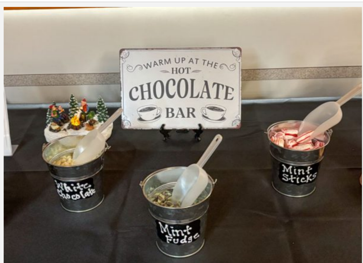
A hot chocolate bar awaited walkers during the Hot Cocoa Walk.

Dozens of people showed up at Depot Park, where they played a mobile game of Bingo as they walked down the trail. When they returned, they enjoyed a hot cocoa bar in the EHS Historical Barn and visited the Elmore Historical Railroad Club depot and the Elmore Log Cabin.