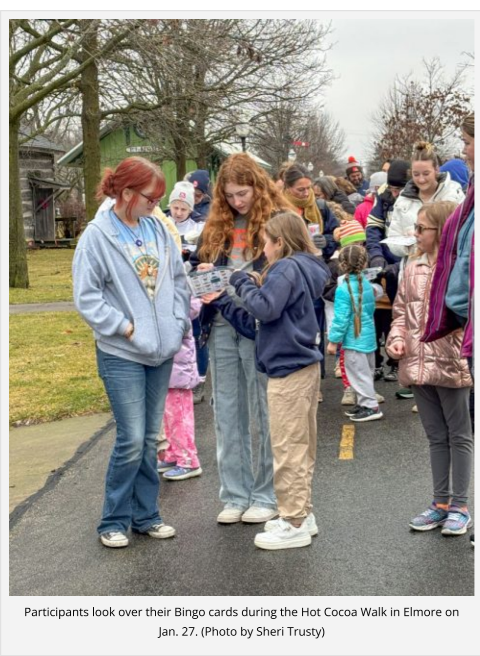
Participants look over their Bingo cards during the Hot Cocoa Walk in Elmore on Jan. 27.

Sometimes, the Park District of Ottawa County delves deeply into community projects like planning inland trails that help provide park accessibility or partnering with communities to improve natural spaces. But sometimes, the park district staff just pops into a community with their arms full of fun.