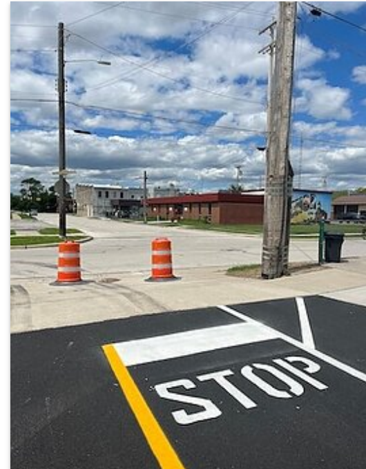
The North Coast Inland Trail extension through Veterans Memorial Park to its terminus at Washington Street in Genoa.

That all started to change in 2018, she says, with the appointment by a probate judge of a three-person board, which soon expanded to five members.